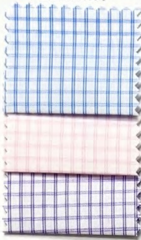
STERLING TWILL 70's