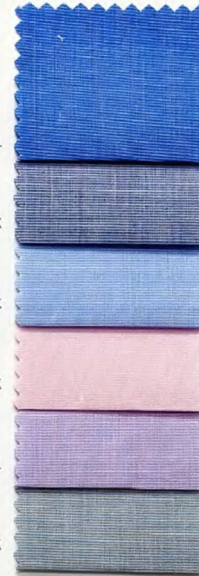
ROYAL OXFORD 80's