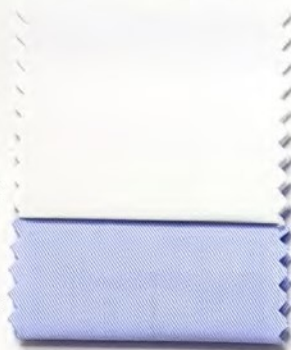
ROYAL OXFORD 140's