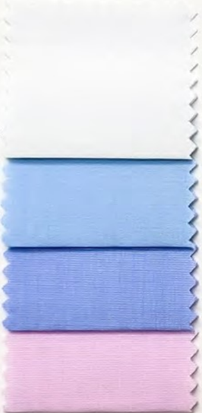
MONTI TWILL 140's